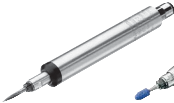
ES 852 ZG