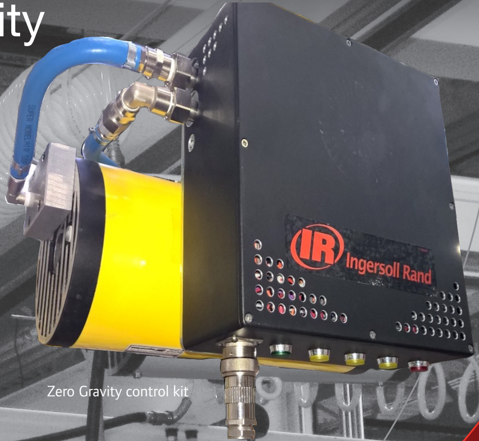
Zero Gravity control kit