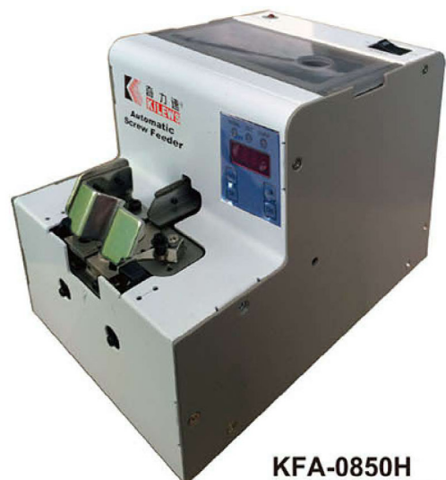
KFA-0850H (PICK UP TYPE)

PCB designed with short circuit and over load protection. Screw feeder and PCB grounding connection is also available. Power On/Off buzzer alert and blinking LED indicator.