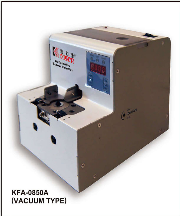
KFA-0850A (VACUUM TYPE)

Prompt delivery and steady screw feeding are the important factors of a screw feeder. We have collected feedbacks from all brands users for their opinions to develop this screw feeder. We integrated our advantages with other brands and eliminated detriments that occurred on other brands. As the result, win situation is provided to both our distributors and customers. Please read operation manual before operating in order to achieve the max value of the screw feeder.